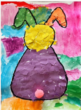
Under 5s Winner Mimi

Congratulations to the winners of our Easter 2025 Drawing Competition! We received so many terrific entries, you should all be very proud of your wonderful drawings.